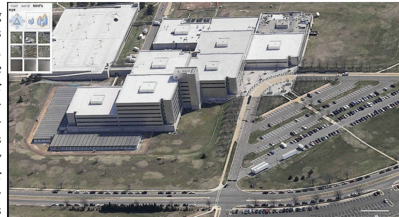
The Defense Intelligence Analysis Center (DIAC) which opened in 1984 at Bolling Air Force Base (now Joint Base Anacostia-Bolling), Washington, DC.

of the Soviet military build-up. Following President Reagan's election in 1980, Secretary of Defense Caspar Weinberger briefed North Atlantic Treaty Organization (NATO) allies on Soviet military developments. Eager to educate their citizens about Moscow's intentions and growing capabilities, a